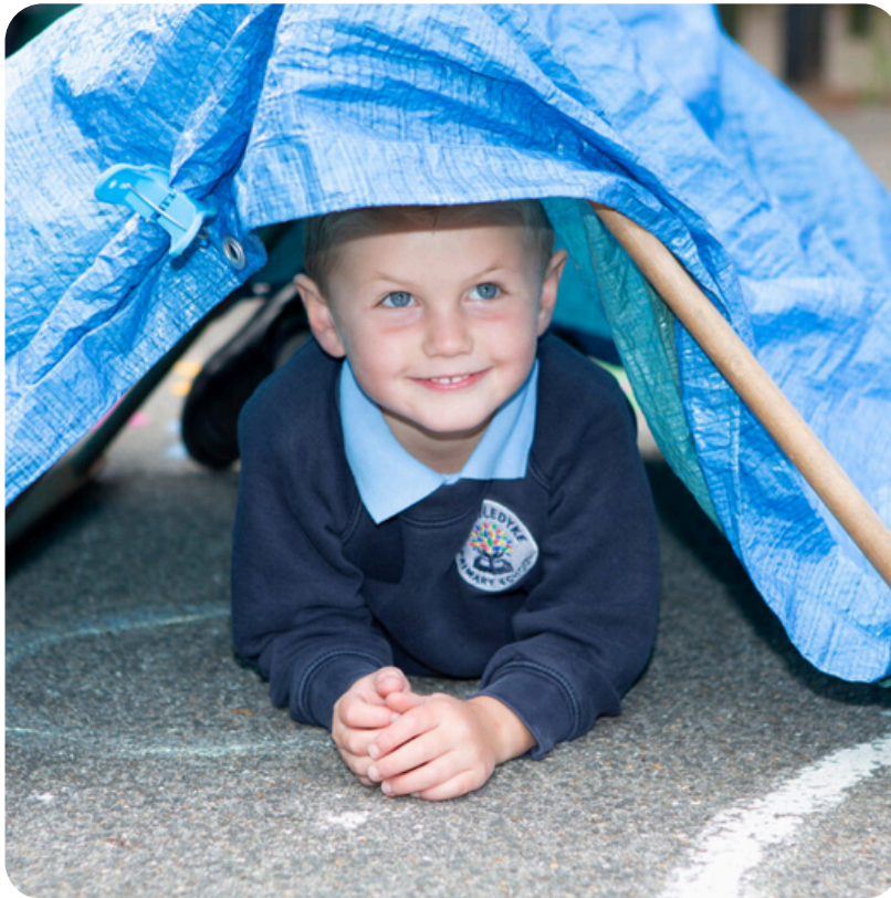
Den building and games.